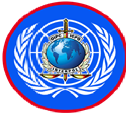
Figure 1: Logo of the International Relations Division of INP 5

Divhubinter Polri supports international missions such as United Nation Peacekeeping Operation, humanitarian mission, cooperation and capacity building with Police from other countries, international organization and other international institutions. The brand mark of Divhubinter Polri is to eradicate transnational crime, another important duty of Divhubinter Polri is giving assistance and protection towards Indonesian citizens abroad.