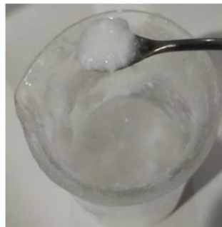
Figure 4. SiO 2 deposits formed after acidification