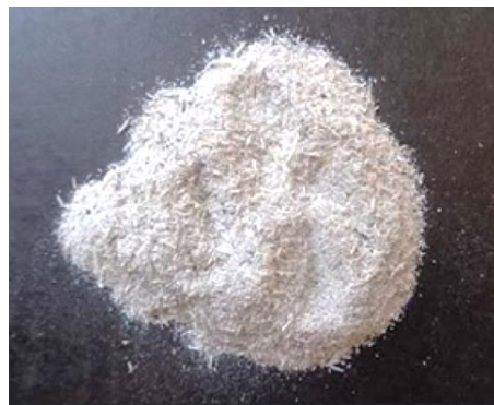
Figure 2. Burning rice husk charcoal after furnace treatment

The result of rice The hydrochloric acid solution here functions as a precipitation agent. SiO 2 compounds are easy to solve in alkaline conditions, and the precipitation process occur in an acidic environment [7]. This phenomena is to create an SiO 2 consolidation easily extracted by rice husks, an alkaline gel solvent, KOH is choosed, and after that an acid solution, 1 N HCl, is used to precipitate it again. After the SiO 2 compound re-settles, the H 2 O levels which affect the moisture of the product can be removed by drying in an oven. SiO 2 deposits produced in this process are SiO 2 deposits which still contain a lot of coprecipitation. The following is a picture of the stages of forming the extracted SiO 2 gel.