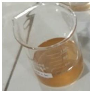
Figure 3. Potassium silica extracted