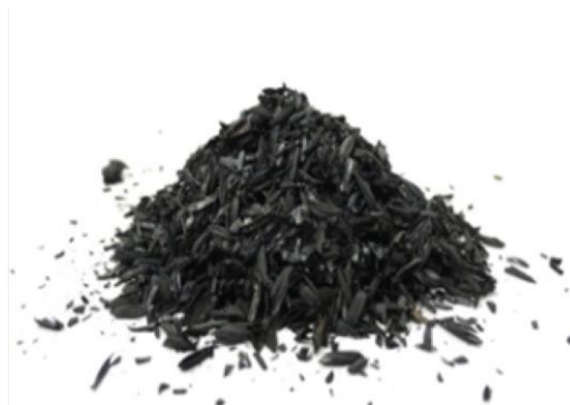
Figure 1. Burning rice husk charcoal before furnace treatment