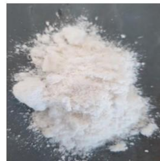
Figure 5. Dried coarse SiO 2 precipitate

Density changes that occur due to the extraction of SiO 2 husk ash using various variations of the KOH and variations of the time for the extraction process. It can be seen in the above photo that the density of SiO 2 gel has a different diversity from each time variation and the KOH concentration variation. The factors that affect density due to extraction include the size of the material. The smaller the particle size, the greater the area of contact between the solid and the solvent. Extraction temperature also affects the density yield. The solubility of the extracted material and diffusivity will increase with increasing temperature. However, too high a temperature can damage the extracted material, so it is necessary to determine the optimum temperature.