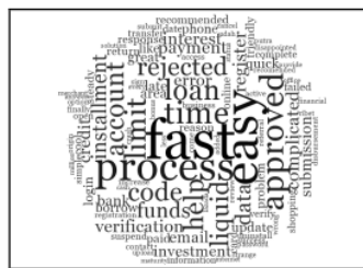
Fig 2. Word frequency word cloud

In order to generate nodes and identify drivers of P2P lending service quality, authors using N-Vivo 12 Word Frequency Query tools. The results visualize as word cloud to make us look easier (Fig. 2).