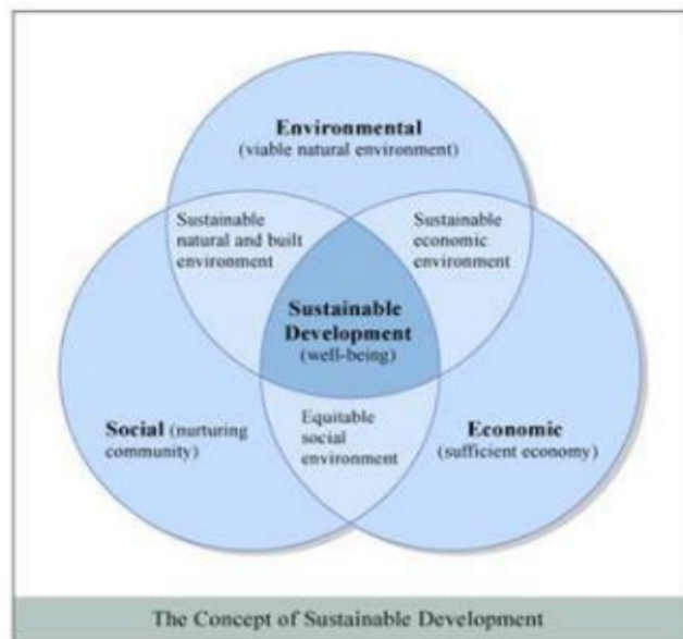
Figure 1. Triple Bottom Line for Sustainability Development

The term "sustainability" could be defined in a variety of ways. It is commonly acknowledged that in order to achieve sustainability, there must be a harmonious balance of economic, environmental, and social considerations. Figure 1 depicts this.